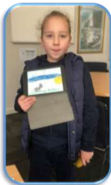
Principals award for some great Maths work on the iPad