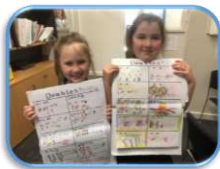
Grade 1 Maths