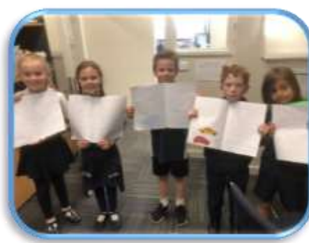
Grade 2 Writing