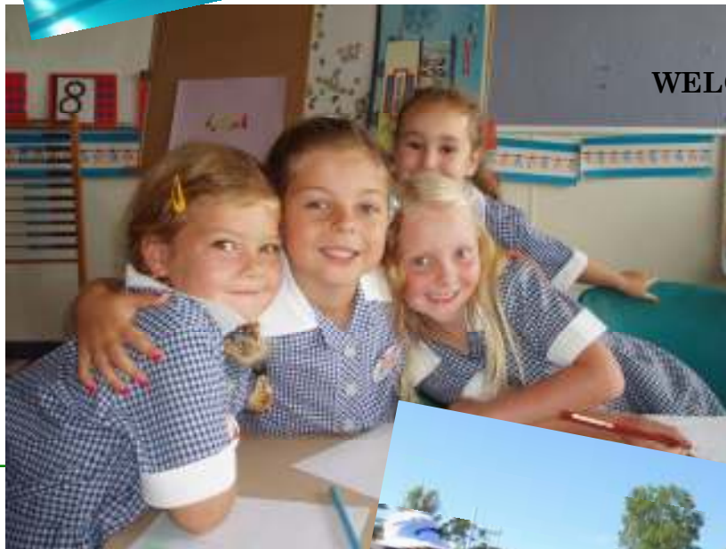
WELCOME TO SOME OF OUR NEW PREPS