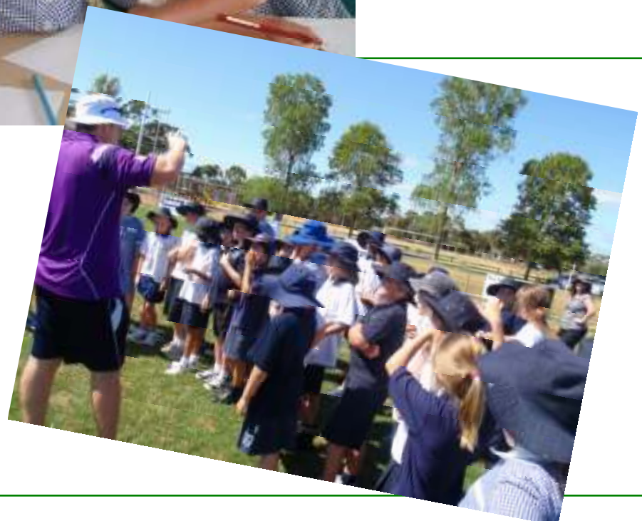
GRADE 4 RUGBY DAY